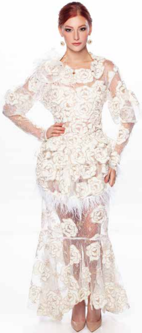
Style: 02 limited edition Viscose, high quality blended fabric, lace