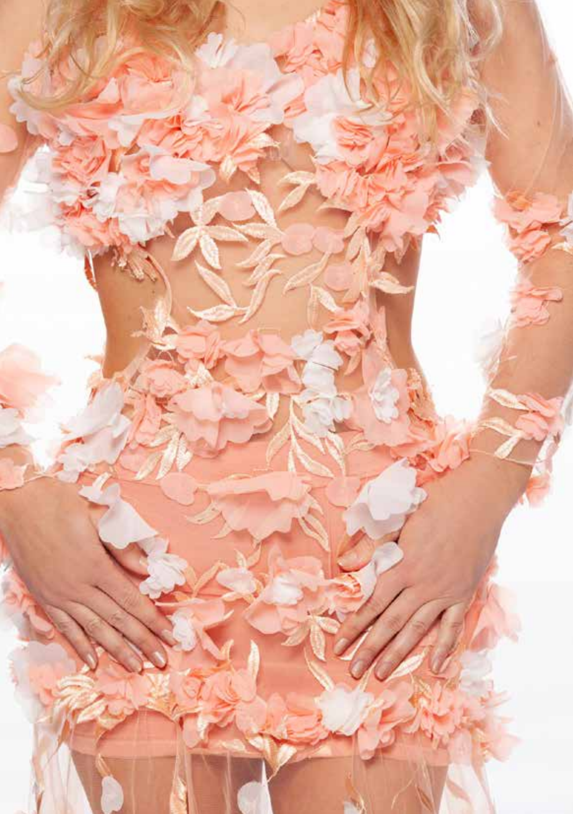
Style: 09 limited edition Viscose, high quality blended fabric, lace