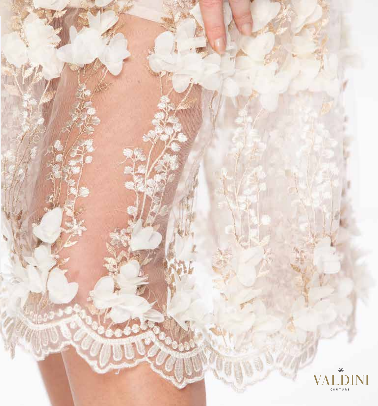
Style: 07 limited edition Viscose, high quality blended fabric, lace