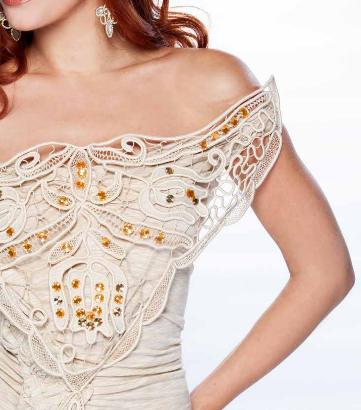
Style: 05 limited edition Viscose, high quality blended fabric, lace