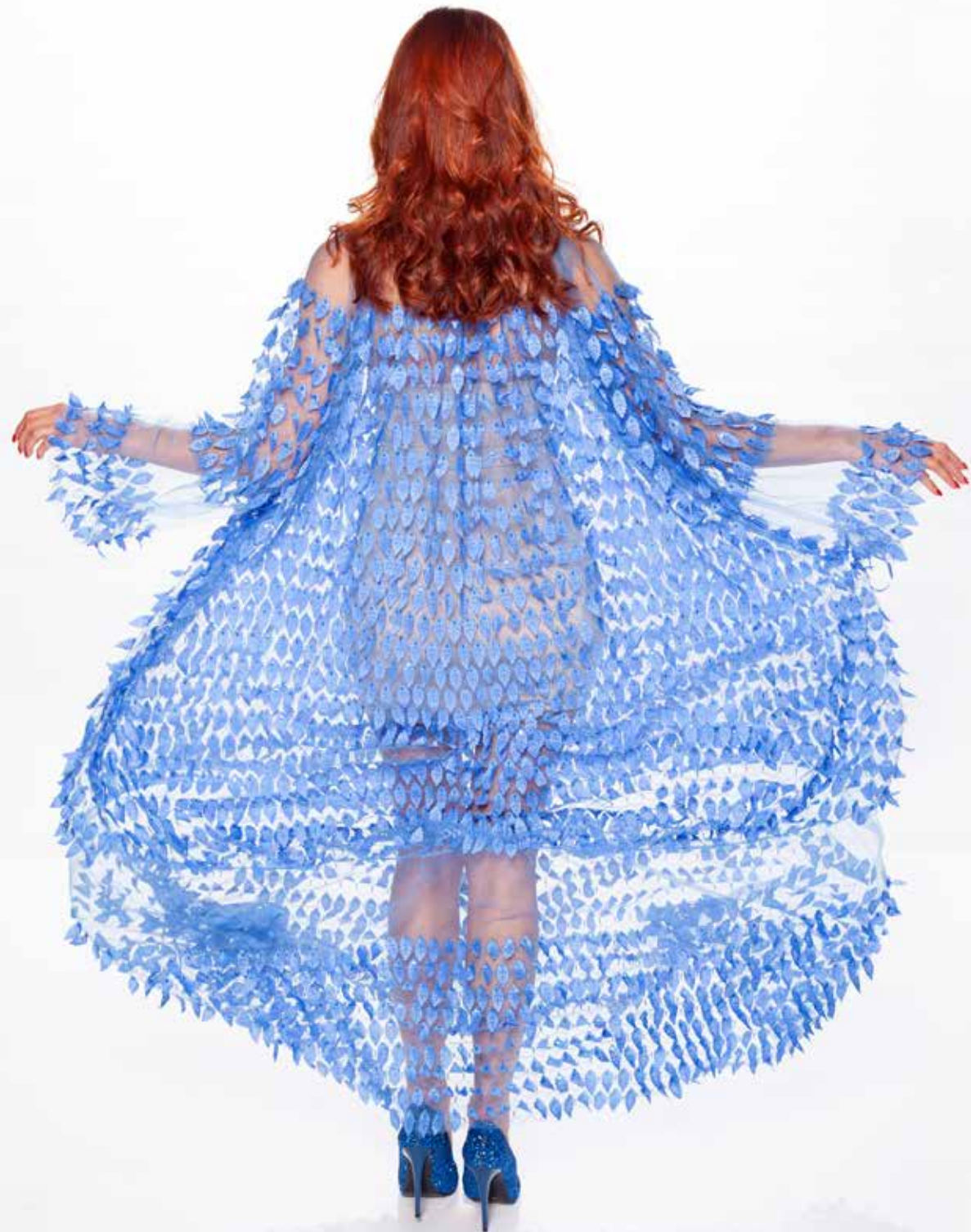
Style: XXXXXXXX Printed long sleeve cold shoulder crinkle chiffon midi with ruffle detailing and key hole Color: XXX Landed Wholesale: 999€